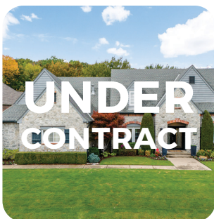
Southern Lakes Estates