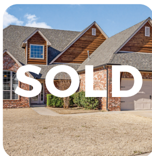
Falcon Ridge Estates