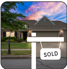
Taylors Pond II

STYLE • STYLE • STYLE • STYLE • STYLE • STYLE • STYLE • STYLE • STYLE • STYLE