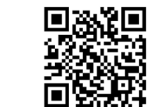
All Active Listings